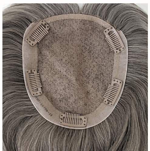
Medium base 5"x 6"